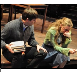
Our Town, PST 2009

lost amidst testing and teenage drama, that each of us can remember a teacher who helped us in invaluable ways to become a better student and person. And now Prime Stage Theatre has a way to recognize those educators like you who are making a difference in the field of adolescent literacy. The first annual "Inspiring Teachers— Inspiring Readers" award will be given in honor of one local teacher who continues to inspire his/ her students to read. Nomination forms can be downloaded on our website, www.primestage.com, and will be accepted through February 1, 2010. Self-nominations will be accepted. selected recipient receive two (2) season