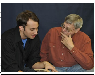
Tuesdays with Morrie, PST 2010

So thank you for embarking upon what for many is their first experience with Shakespeare. Thank you for taking the time to nurture a deeper awakening of this dead guy's importance in our cultural heritage. And