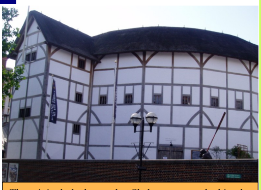
The original playhouse that Shakespeare worked in, the Globe Theatre, is no longer standing. However, a close replica based on 16th century sketches of English Renaissance playhouses was built. Shakespeare's Globe Theatre was opened in 1997 on the South Bank of the Thames River in London, United Kingdom.

own playhouse. Shakespeare's company, the Lord Chamberlain's Men, performed at the Globe Theatre. They would typically perform one play a day. If a play flopped, it would quickly be forgotten. But if it was well-received, it would be revived again and again in the company's repertory.