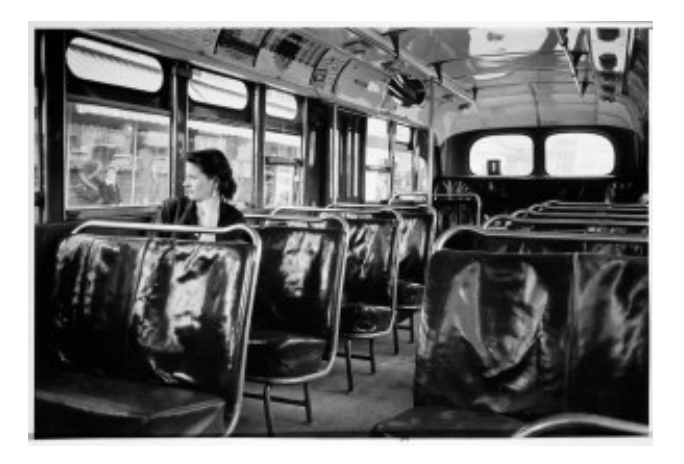
Photograph of an empty bus during the Montgomery Bus Boycott.

Teachers, you may want to provide some facts and a little background about what spurred the boycott. The boycott took place from December 5, 1955, to December 20, 1956, and is regarded as the first large-scale U.S. demonstration against segregation. A group of people, mostly Black organized a boycott in only four days. During this part of the 20<sup>th</sup> century, busses were often the sole transportation for African Americans. When the Blacks boycotted the bus service, business suffered and eventually laws were changed. The boycott was organized because Rosa Parks, an African American woman, was arrested and fined for refusing to yield her bus seat to a white man.